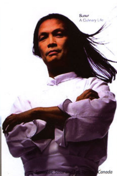
Susur A Culinary Life